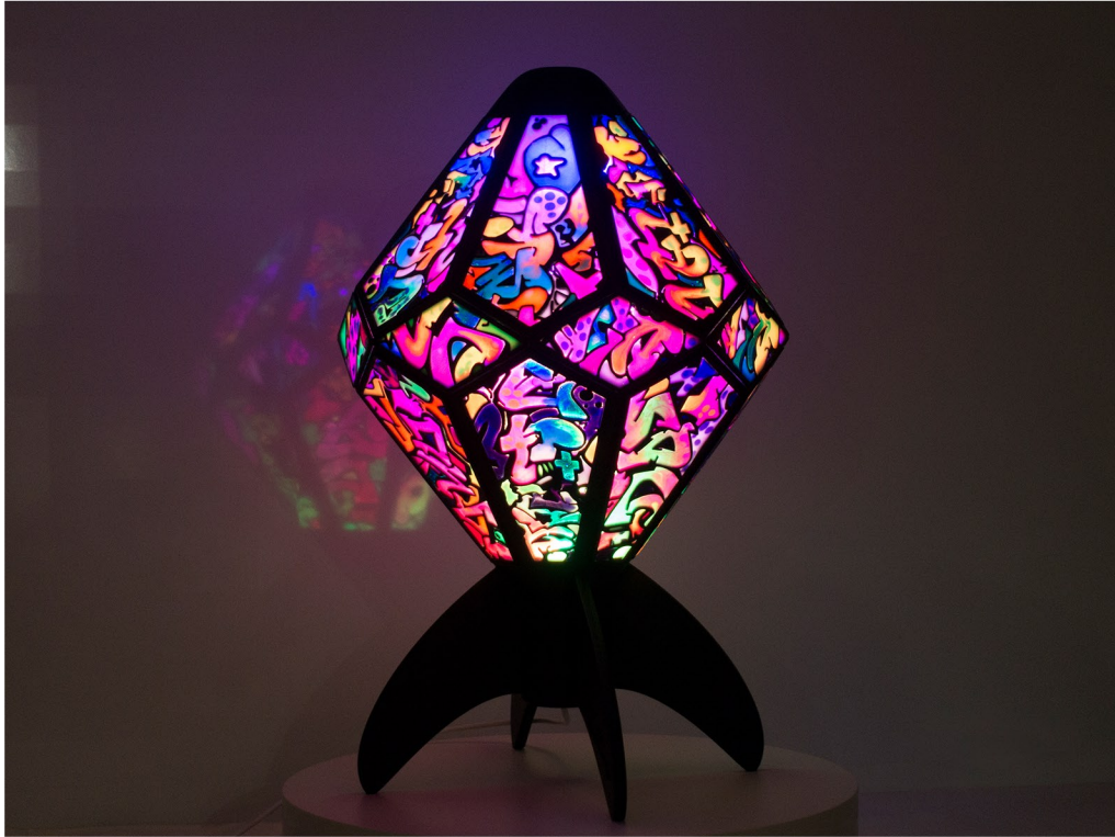
Light Bomb (2026), 3D printed PLA, and pigmented resin, 10" x 16" x 10"