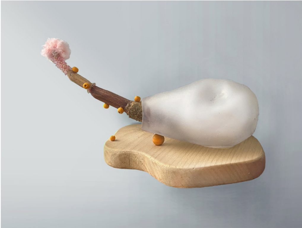
Untitled (Sculptural sketch of earthly beings #3) 2025, Glass, wool, wood, aroma molecules, 9" x 5" x 5"