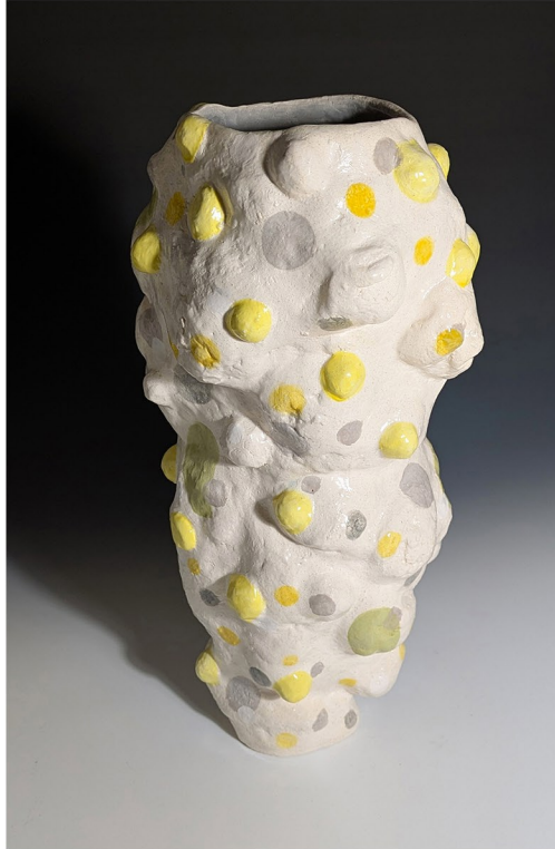
Yellow, Green and Grey Speckled Vessel (2024), Stoneware, Underglaze and Glaze, 7.5" x 14.5" x 7"