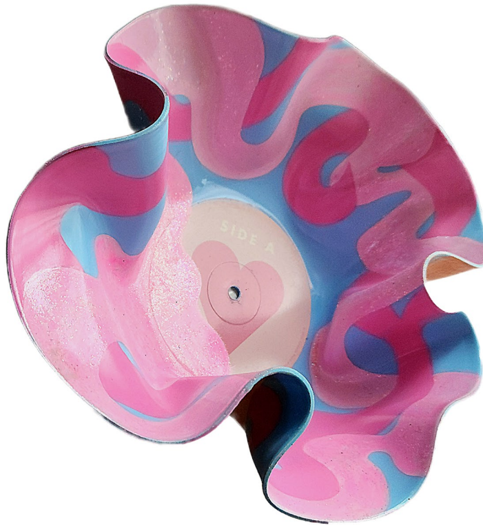
Vinyl Record Bowl Pink (2025), Acrylic, glitter, and enamel on vinyl record bowl, 10" x 3" x 9.5"