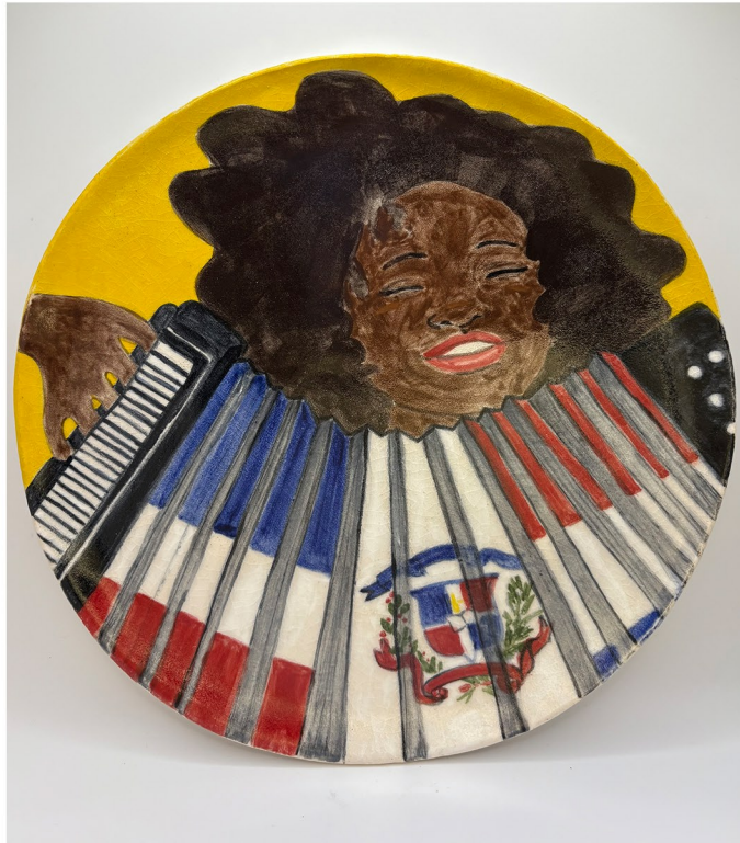
Musica Tipica (2025), Ceramic and underglaze, 9" x 1" x 9"