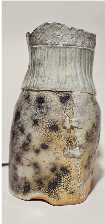
Scarf (2025), Wood fired Ceramic, 6" x 10" x 6"