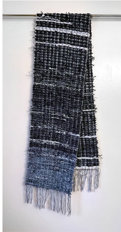
Knotty Waffle Table Runner (2022), Cotton, acrylic, 11" x 80"