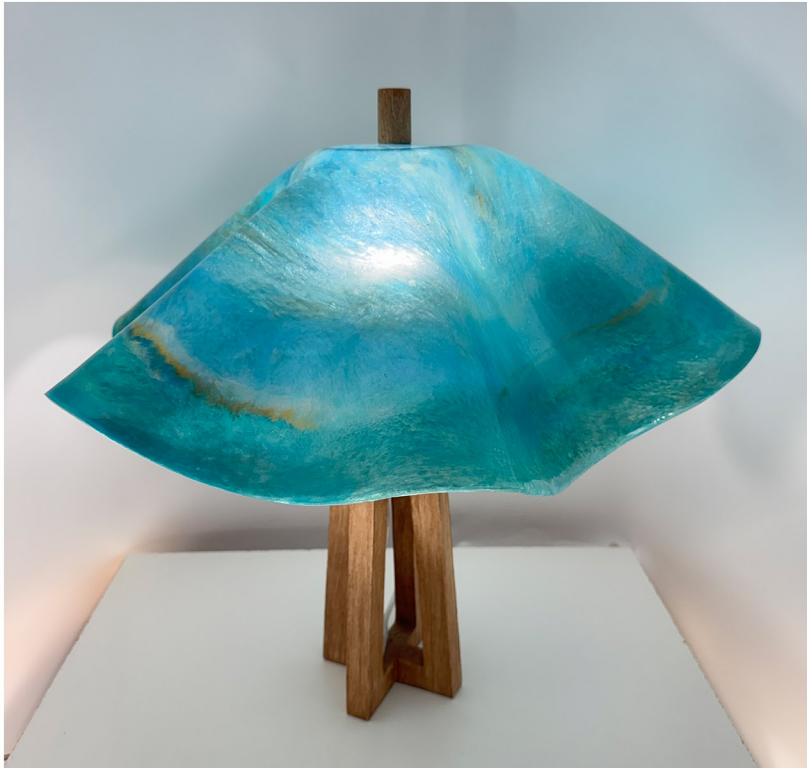
Resin Lamp Shade (2025), Epoxy resin, 19" x 9"