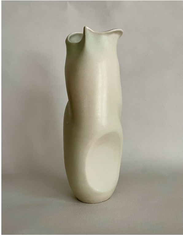
Altered Vessel (2025), Porcelain, 4" x 12" x 4"