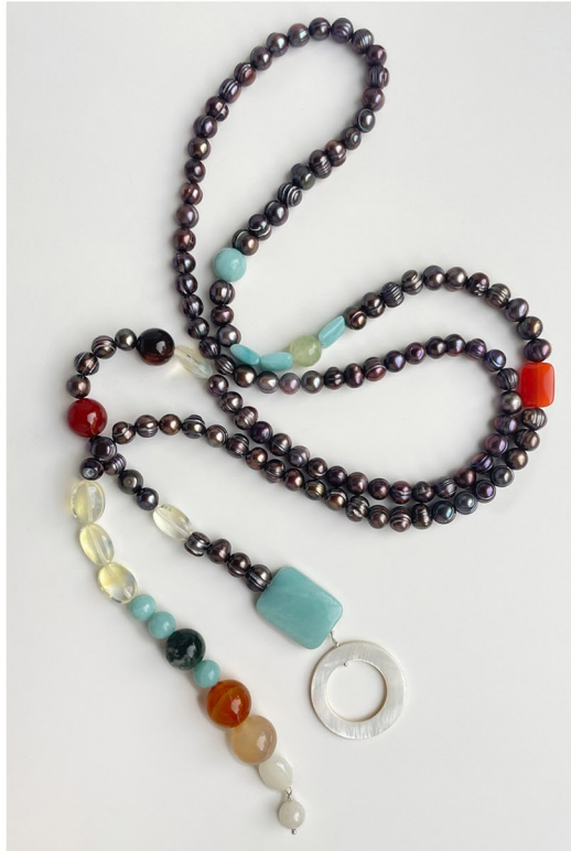
Searope2 , Fresh water pearls, mother of pearl, carnelian, agate, turquoise, citrine, hematite, labradorite, aventurine, 44”