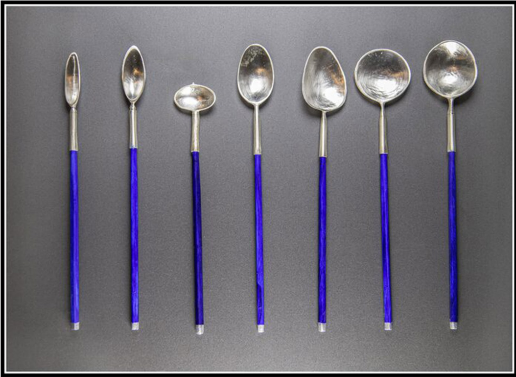
Large Sterling Spoons (2025), Sterling, wood, 1" x 8" x 1"