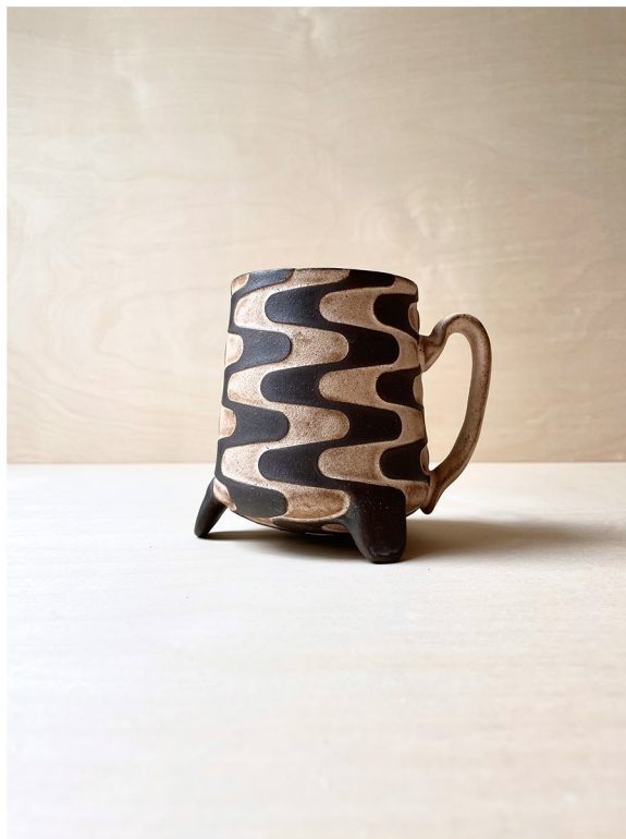
Squiggle Mug (2025), Stoneware, handbuilt, cone 6 oxidation, 4" x 4" x 3.5"