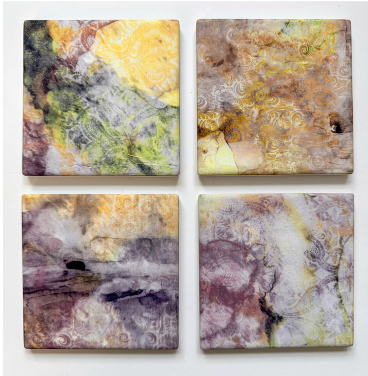
Natural Brocade - Four Coasters (2016), Sandstone and cork, 4" x 4" x 0.25"