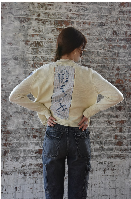
Encoded sweater (2021), Textiles: knit, embroidery, 40" x 15"