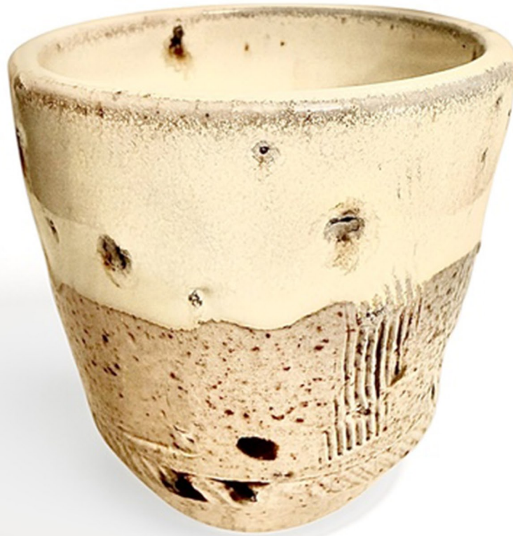
Yunomi (2023), Porcelain, 3" x 3" x 3"