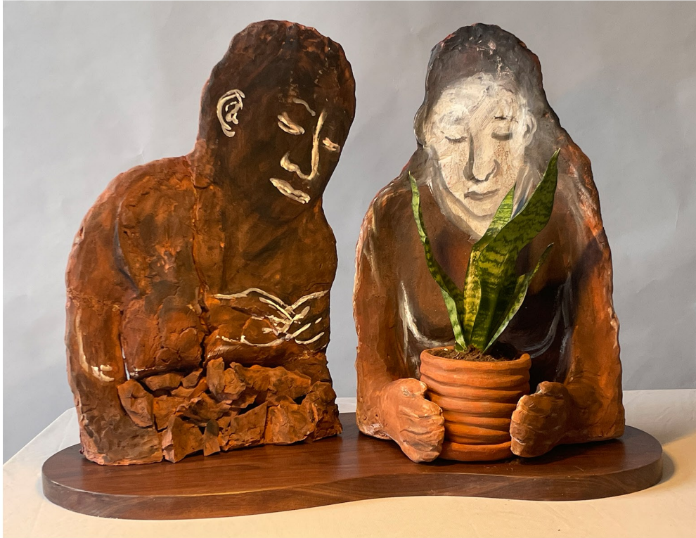
Keep Hope Alive Planter (2025), Ceramic (fired) oxide stains, oil paint, plant, on walnut, 26" x 20.75" x 12"