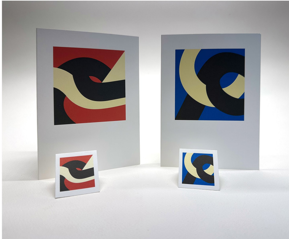
Typographic Nude Note Cards (2005), Offset Printing on paper, 4.5" x 6"