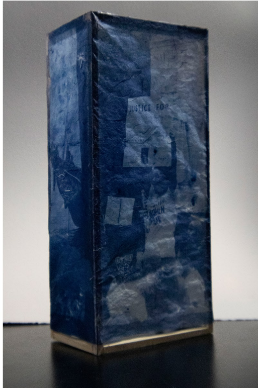
Justice lamp (2025), Cyanotype on mulberry paper, wood frame, 3.5" × 5.5" × 12"