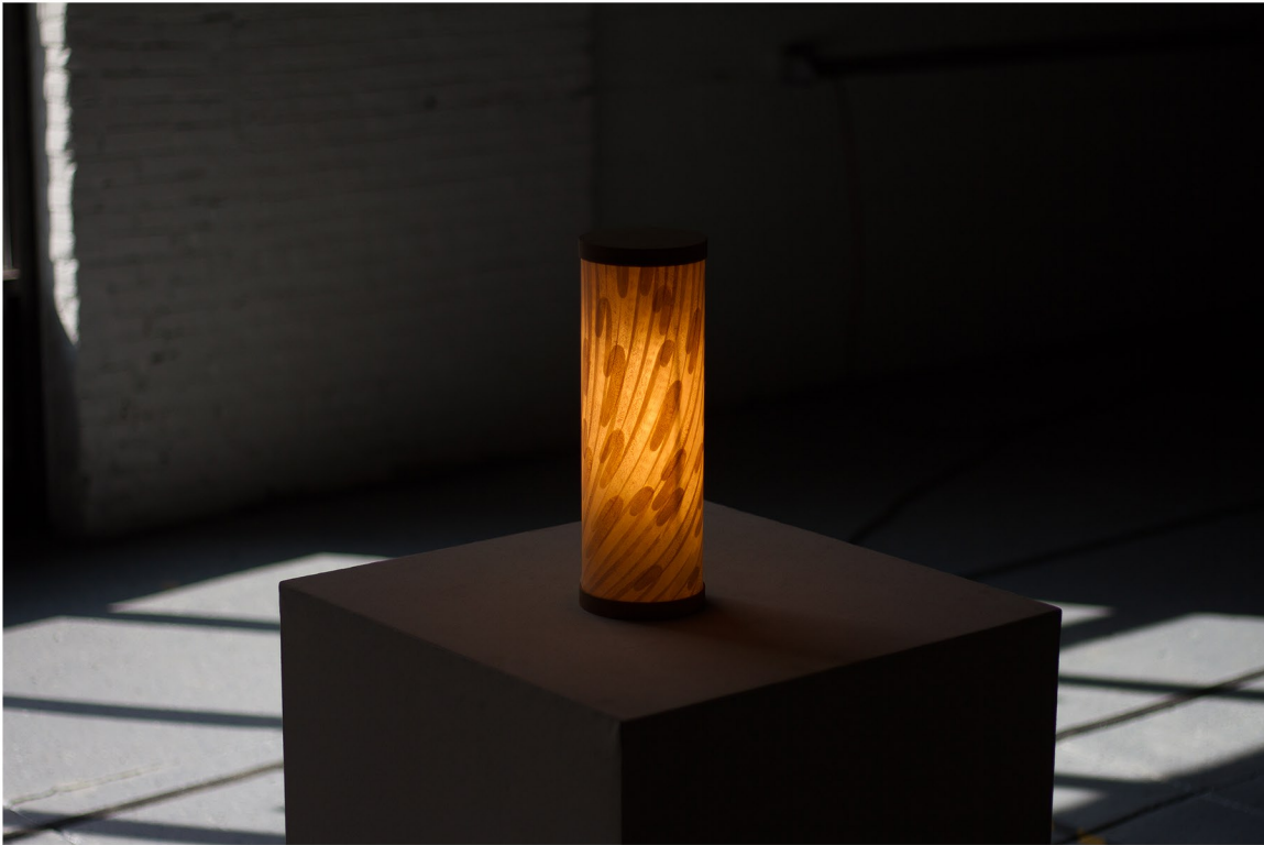
Shavings Column (2025), Wood shavings, acrylic tube, lamp parts, 5" x 15" x 5"