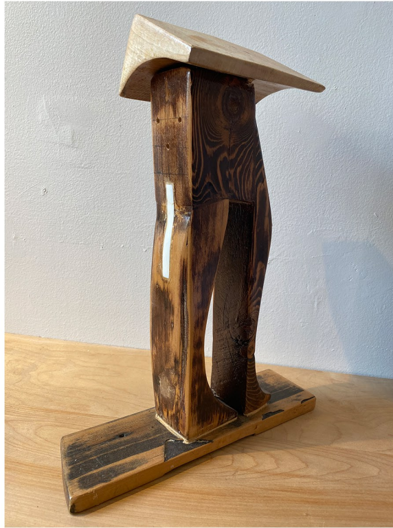
Solitary Bee House Brown #1 (2023), Salvaged wood, recycled ivory, bamboo, 12" x 16" x 6"