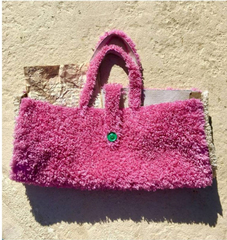
Carpet Bag with 13th Amendment (2023), Found bathmat, carpet, paper, ink, stain, thread, button, 18" x 16" x 5"