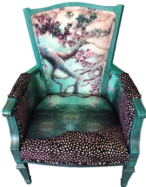
Plum Breeze (2024), Upcycled chair from 50's, custom fabric, paint, 25" x 40" x 18"