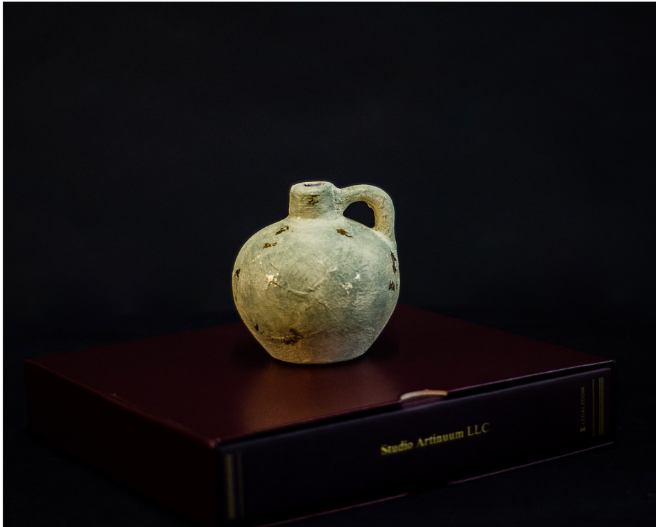
Collection 2 (2023), Ceramic, acrylic color, 8" x 6" x 8"