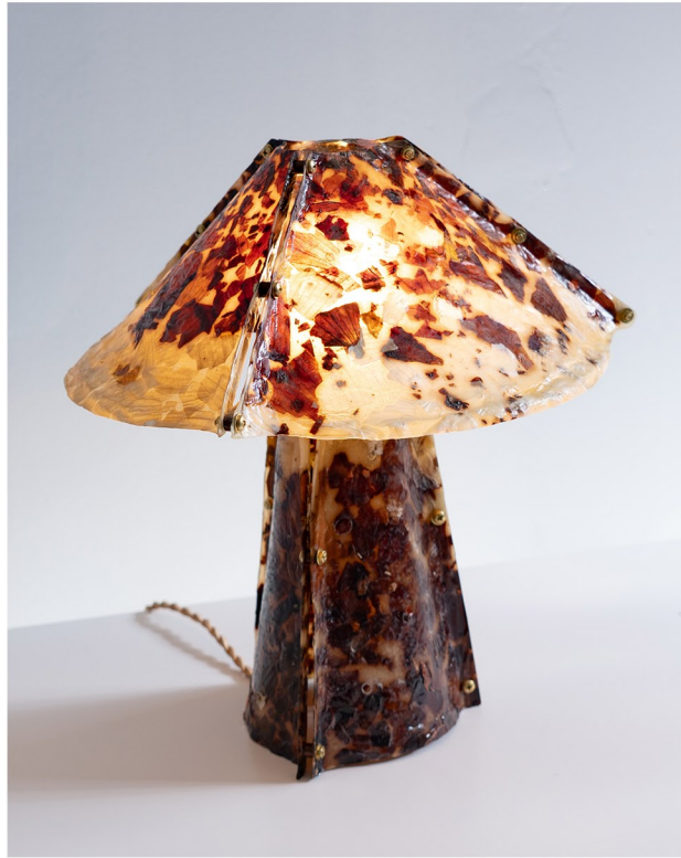
Daily Peel (2026), Onion skin bio material, light, 13.5" x 15" x 13.5"