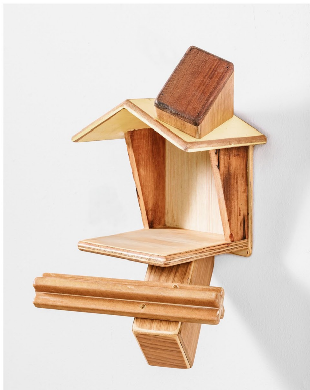
Birdhouse (2023), Reclaimed lumber, 12" x 18" x 1"