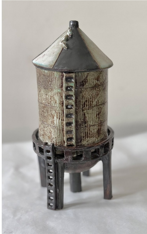
NY Watertower (2024), clay, 5" x 9" x 5"