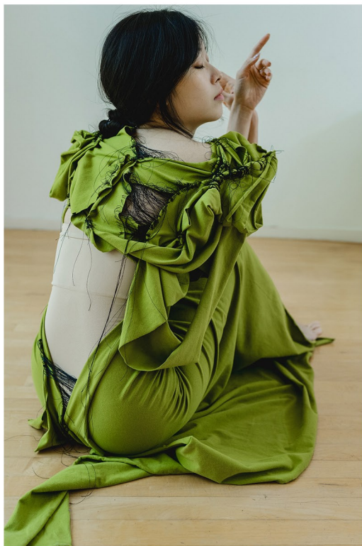
TENSION Chartreuse (2025), Chartreuse cotton knit fabric, black nylon upholstery thread, 36" x 40" x 36", Silviia Maliukova (photo credit)