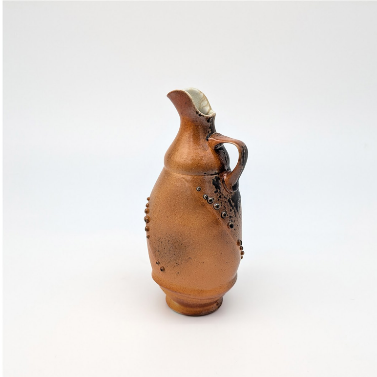
Pouring Jug (2025), Wood-fired porcelain, 3.5" x 7.5" x 3.5"