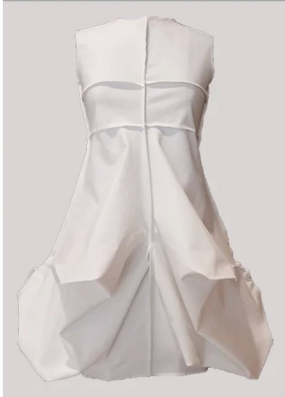
White dress soft sculpture (2021), Cotton fabric with lycra, 40" x 40" x 40"