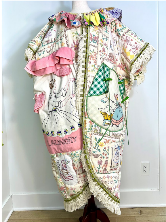
Laundry Day Chore Coat (2024), Sewn fabric, 36" x 50" x 14"