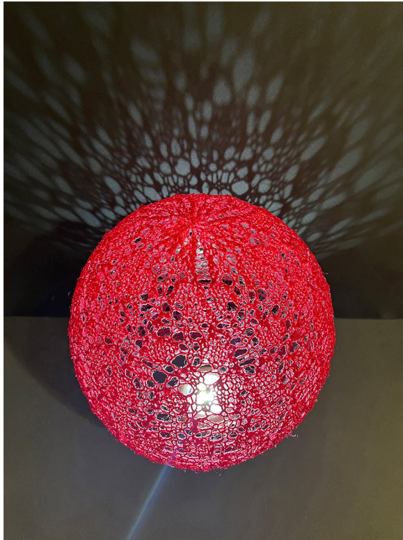
IlluminKnit - Cherry Bomb (2025), Hand dyed, handknit yarn, stiffened with glue, light fixture, 12" x 12" x 12"