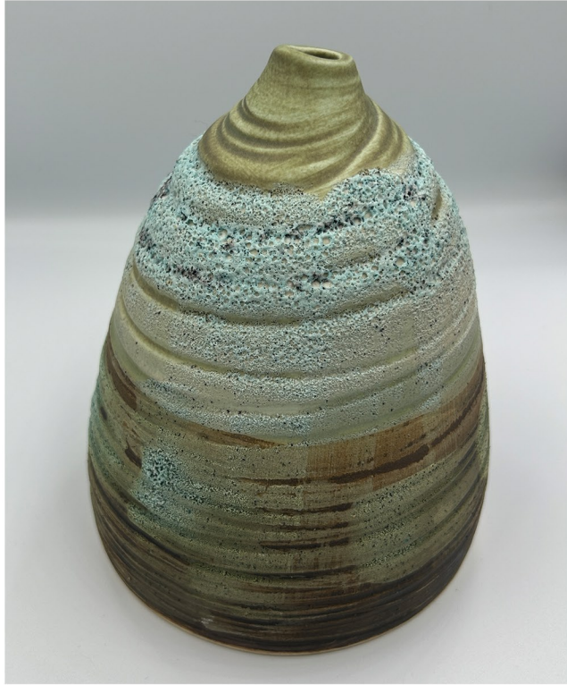
Spin (2025), Clay and glaze, 8" x 11" x 7"