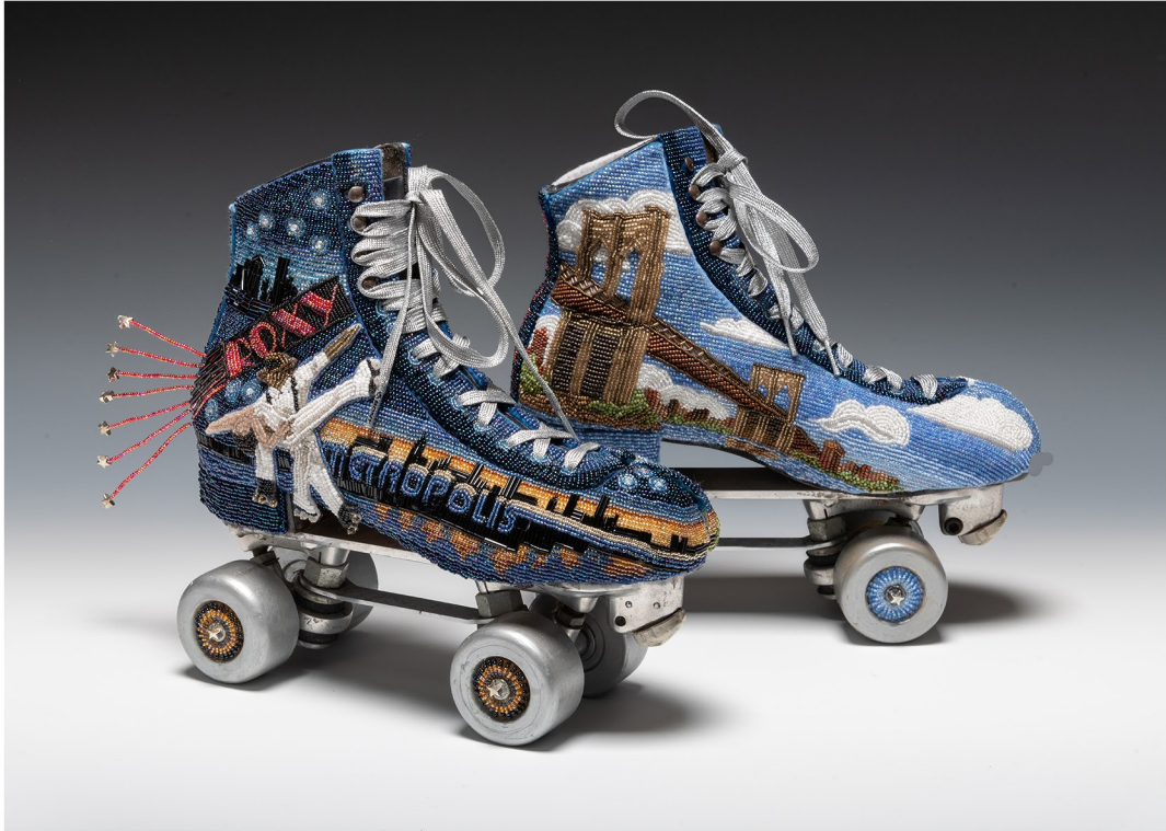
Disco Skate NYC (2025), Bead Embroidery, mixed media, 14" x 11" x 9"