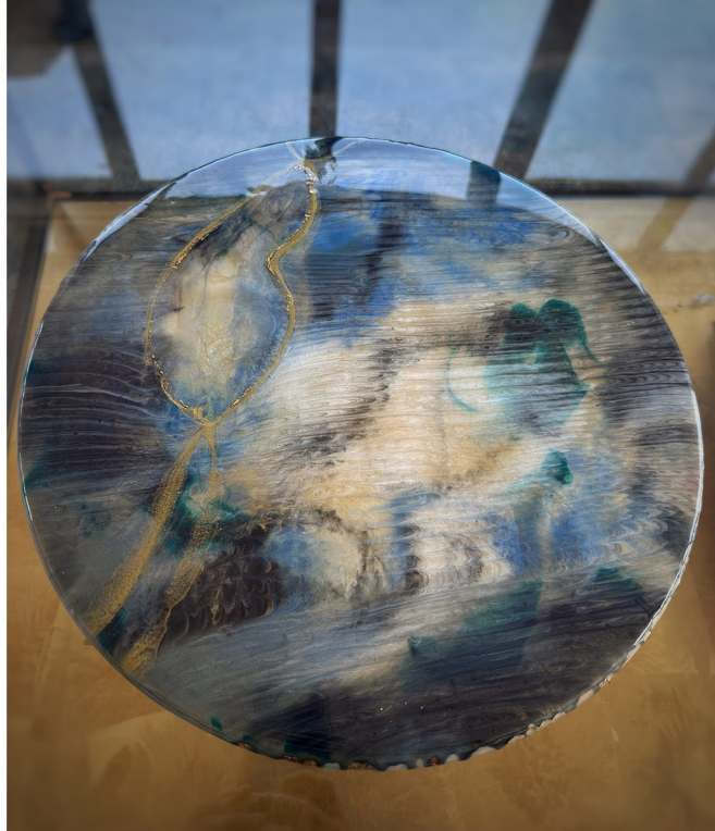
Lazy Susan (2025), Epoxy and Metal Leaf on Wood, 15" Diameter