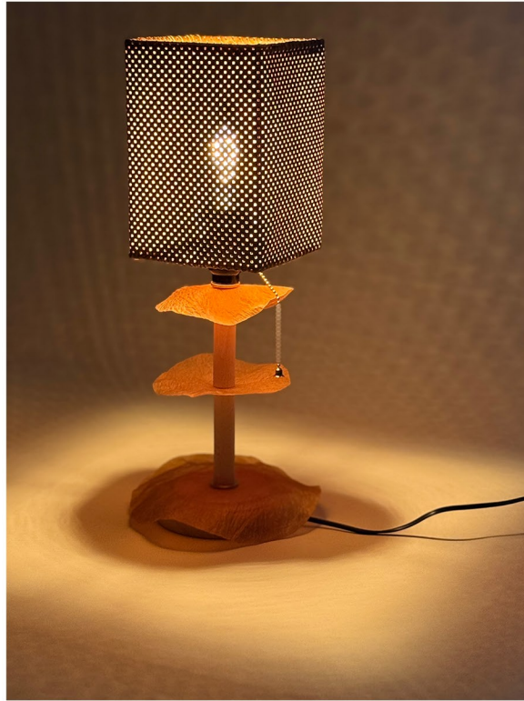
Nocturne I (2025), Cork fabric, wood, SCOPY Paper, 6" x 18" x 5.5"