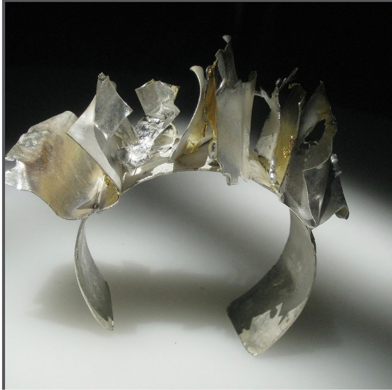
Leaves Cuff (2015), Fine silver, sterling silver and keum boo 22kt gold, 2" x 4" x 2"