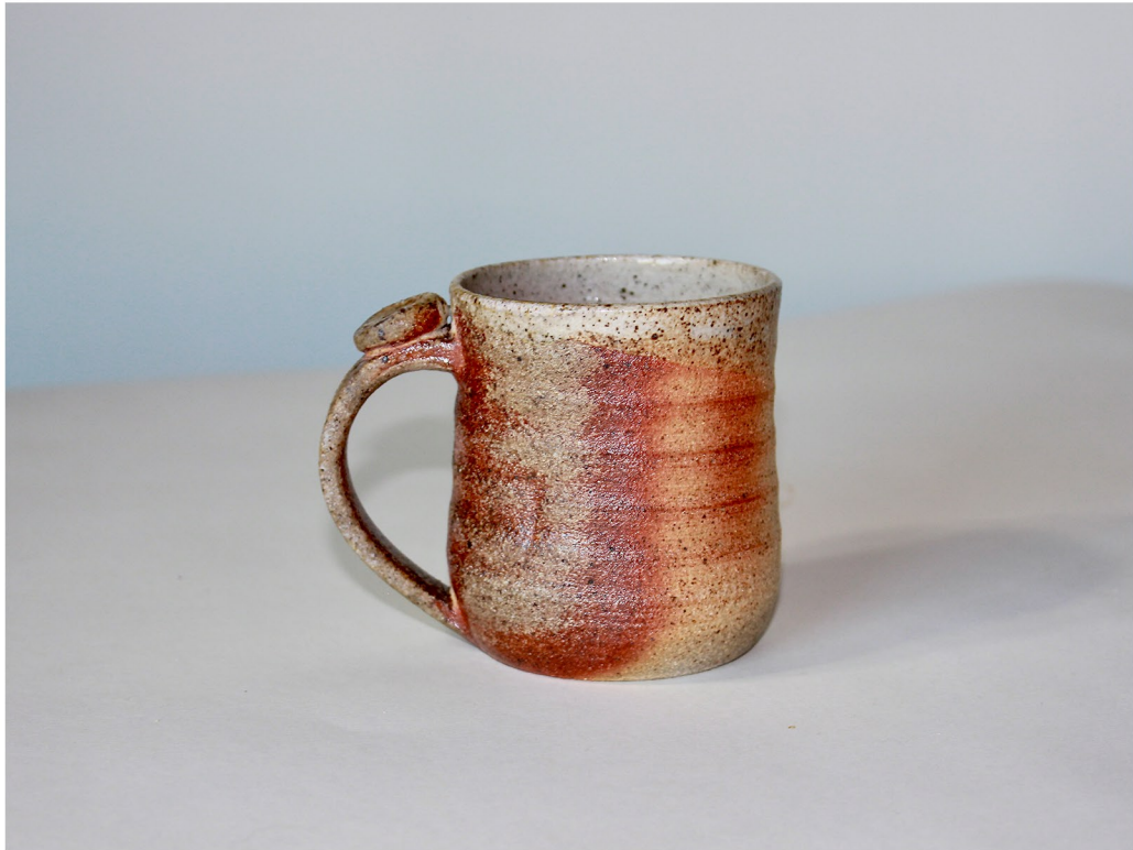
Heat Map (2025), Wood-fired stoneware, 4.5" x 4" x 4"