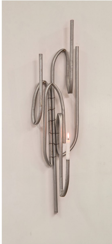
Sconce (2026), Sculpture, 10" x 30" x 8"