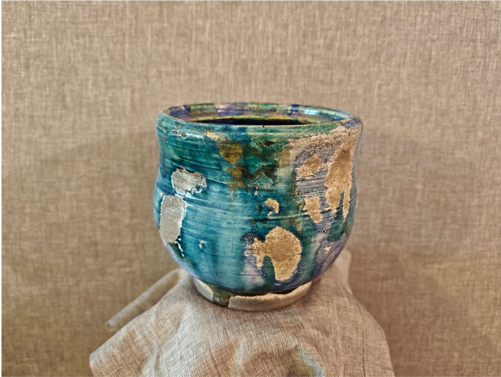
Raku Number-16 (2025), Raku-fired Stoneware, 3" x 4.5" x 4.5"