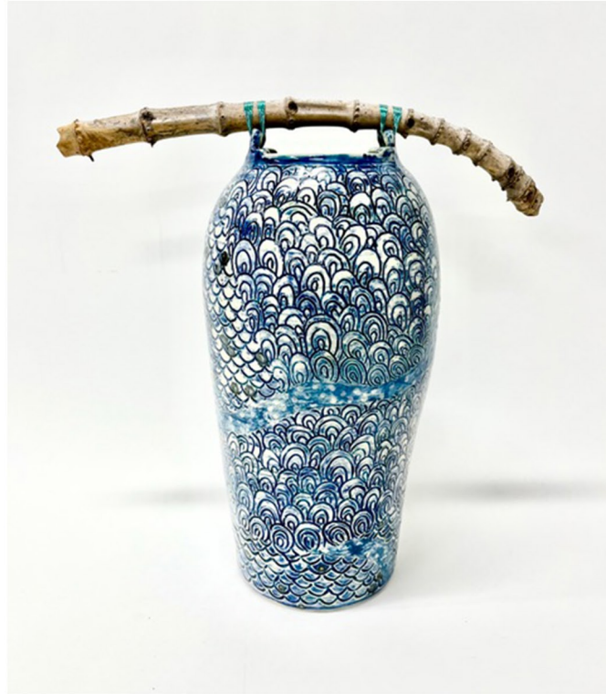
Deconstructed Fish (2025), Clay, 14.25" x 15.25" x 6.5"