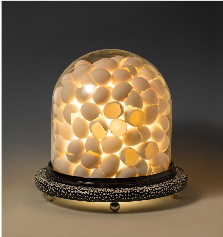
Chaos & Tranquility Coexist (2024), Mixed, 14" x 15" x 14"