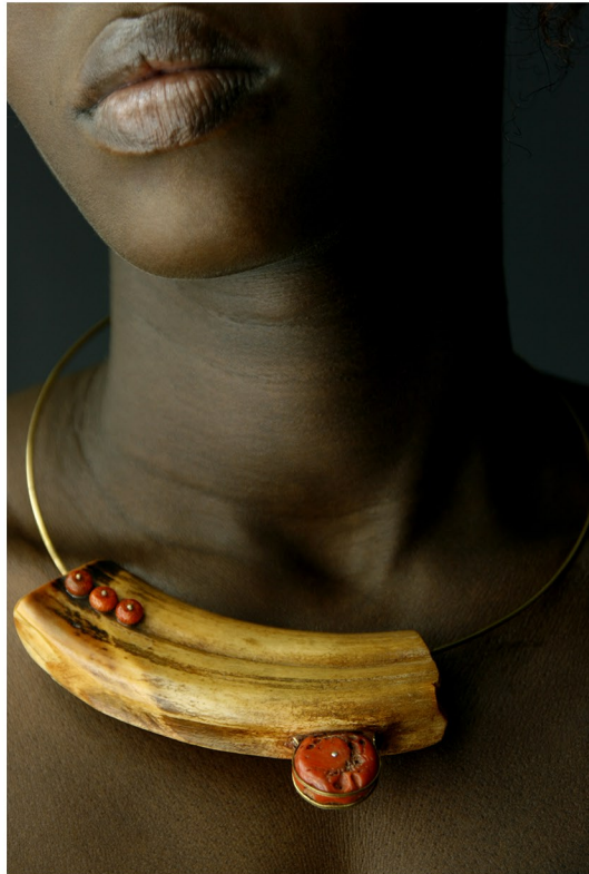
Tonia Marek Coro (2008), Wild boar tusk, coral, bronze, 9" x 8" x 1"