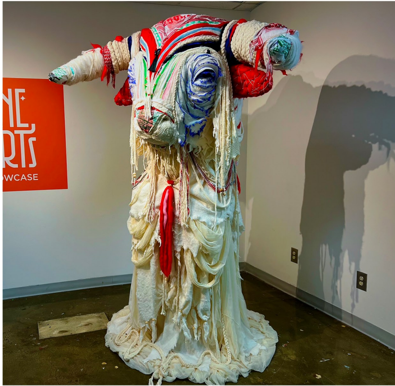
Masina Omby (2025), Assorted textiles, 5' x 7.5' x 3.5'