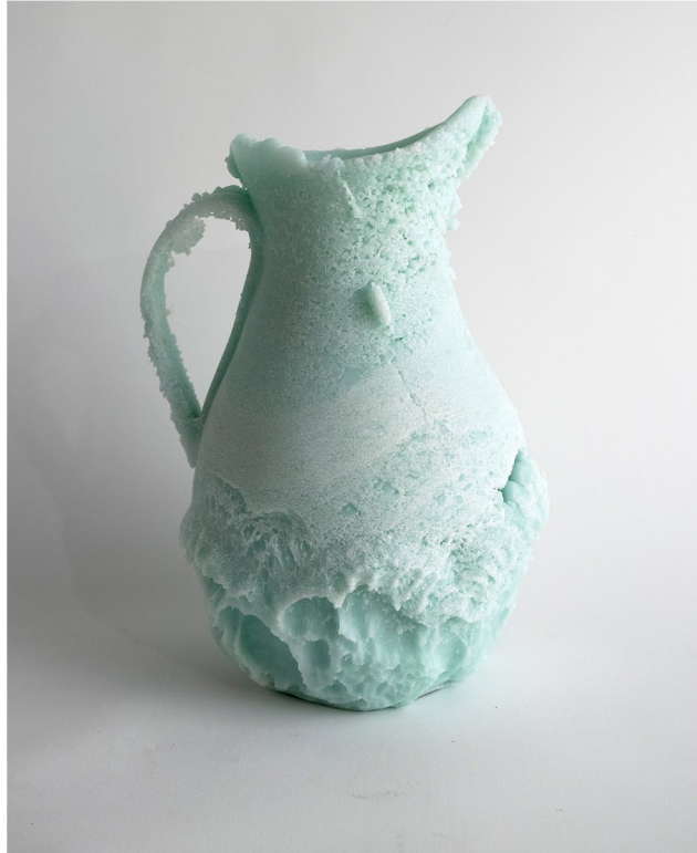
Pitch'er, Crusty (2025), Kiln cast Topo Chico seltzer bottle, 8" x 12" x 8"