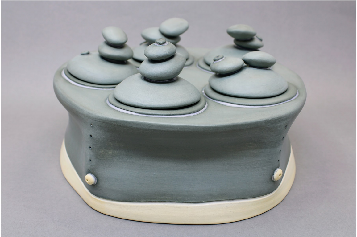
Five Spice Jar (2025), Porcelain with terra sigillata, 9" x 7" x 9"