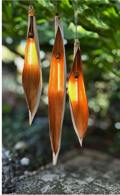
Palm Pod Trio (2025), Mixed-media light fixtures (each), 6" x 43" x 4"