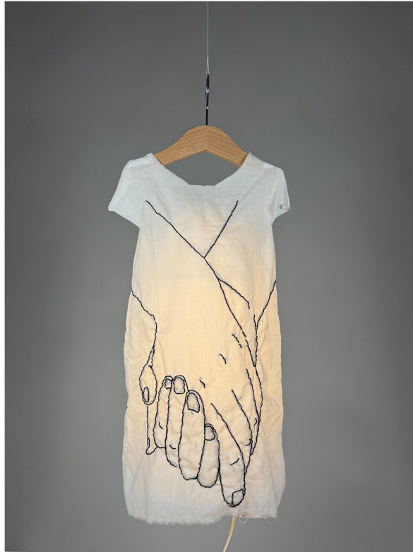
Remnant of Love (2025), Discarded pillow case, cross stitch thread, hanger, light, 18" x 24" x 5"