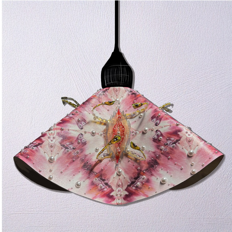
Space Garden 1970 RetroFuturistic (2025), Pigment digital print on canvas & film/ UV resin/pearl work, 14" x 8" x 14"