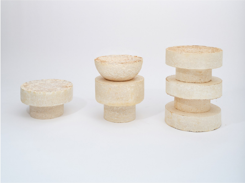
Play (2024), Mushroom spores and wood scraps, 16" x 16" x 16"